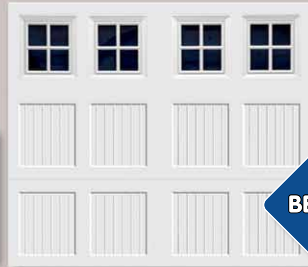
Optional Small Stockton Windows - D5