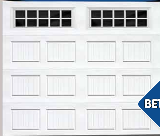
Optional Large Stockton Windows